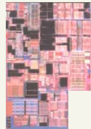
Penryn CPU core

4 CPU cores 45nm Process <270mm 2 ? 731M transistors 8MB Cache