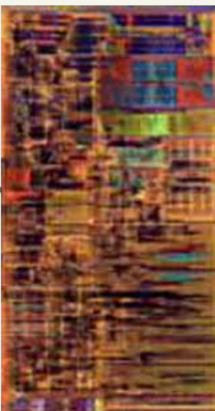
Nehalem CPU core